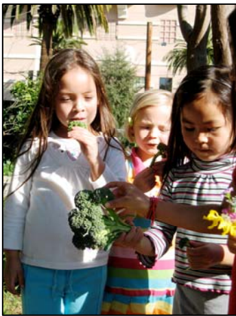
Magic Light enjoying some of their farm-grown broccoli

Although it is the middle of winter, lots of fun things are popping up at the farm. The Savvy Sailors have a lovely bed of lettuces, peas, and cabbage. The California Dreamers have already harvested their potato crop, and of course, purple potatoes have been planted by the Purple Porcupines. The middle school farm students are still sowing Napa cabbage, lettuce, and spinach. They have been eating their greens and some of the Savvy Sailors' as well! Thanks for sharing.