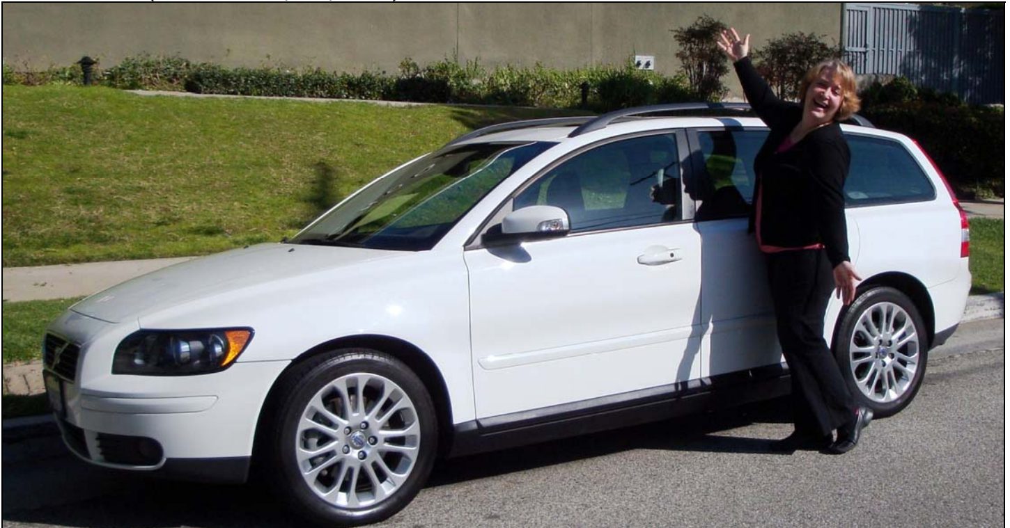
(Model is not included with purchase of car.)

Waverly dad, Robert R., is selling his 2007 Volvo V50 2.5L T5. In excellent condition inside and out, one owner, leather seats, quartz beige interior, integrated child booster cushions, keyless entry and ignition, pwr windows/locks/seats/mirrors/moonroof, split folding rear seat, alarm, roof rails, tilt wheel, climate control, stereo/cd, alloy wheels, cruise control, Homelink. Still under manufacturer's warranty-24,700miles, $21,499. Contact Robert (details in today's e-packet) for more information.