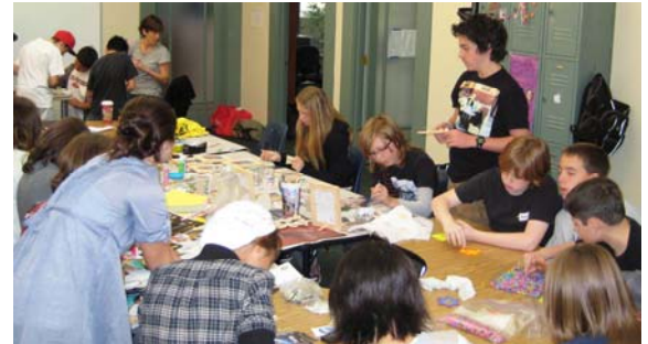
Middle School Students Crafting Away!

The Waverly World Market begins exactly one week from today! Thank you to all those who have crafted, sewed, baked, and created. We are very excited about everything that has been donated. A very special thanks to the grown-ups who organized and worked with the students during Teacher Appreciation day to create gifts for the World Market.