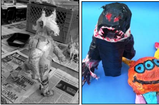
Middle School Art

Middle school students are working on a design shape project. High school's Art I is working on one-point perspective projects. Linear perspective is the technique of suggesting distance with parallel lines that converge as they recede. In one-point perspective those lines meet at a single spot called the vanishing point.