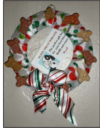
Parent Deveney's dog wreathes