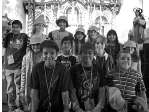
Some of the California Dreamers in front of the only still standing chapel

California Dreamers are studying California, and earlier this week visited one of the remaining missions, Mission San Juan Capistrano. Here are some California Dreamers' impressions: