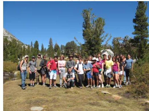
Hike to Rock Lake

Saturday, we took a short hike to Devil's Postpile followed by free play in the San Joaquin River; then up to the Mono Lake Visitor Center. Our Saturday afternoon was spent swimming and sunning at June Lake, while Saturday night involved a surprise dinner of salads, burgers, and fries at Burger's Restaurant (formerly Berger's Burgers).